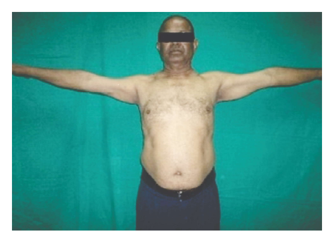
Fig. 6 Preoperative photograph showing left brachial plexus injury.