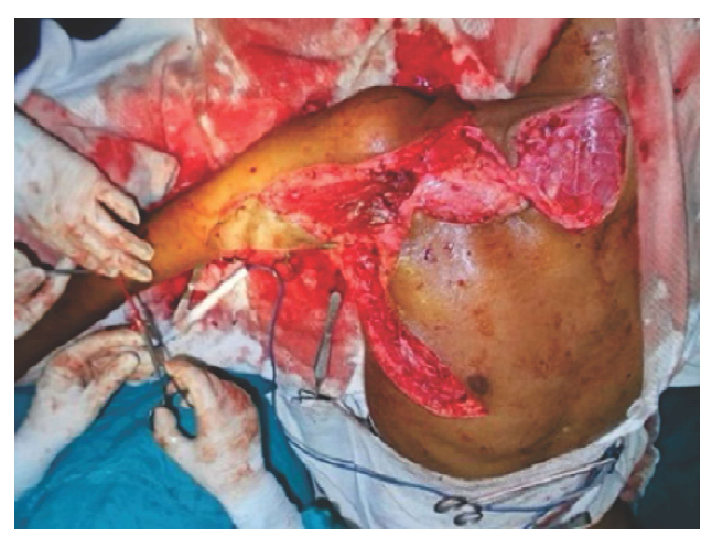
Fig. 7 Intraoperative photograph (patient shown in Figure 6) showing neurotization of ulnar nerve fascicle (to FCU) to branch to biceps and median nerve fascicle (to FCR) to branch to brachialis.